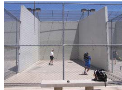
Al Fresco tournament courts.