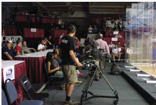
TV cameras and fans outside the portable glass court at Lynmar.